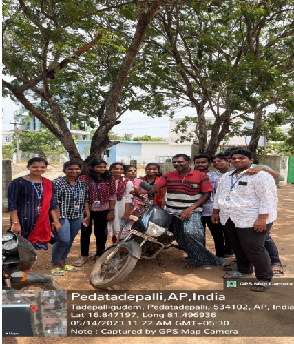
Pedatadepalli, AP, India Tadepalligudem, Pedatadepalli, 534102, AP, India Lat: 16.847197, Long 81.496936 05/14/2023 11:22 AM GMT+05:30 Note : Captured by GPS Map Camera