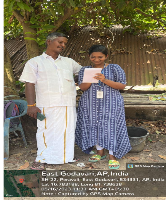
East Godavari, AP, India SH 22, Peravali, East Godavari, 534331, AP, India Lat 16.783188, Long 81.738628 05/16/2023 11:37 AM GMT+05:30 Note : Captured by GPS Map Camera