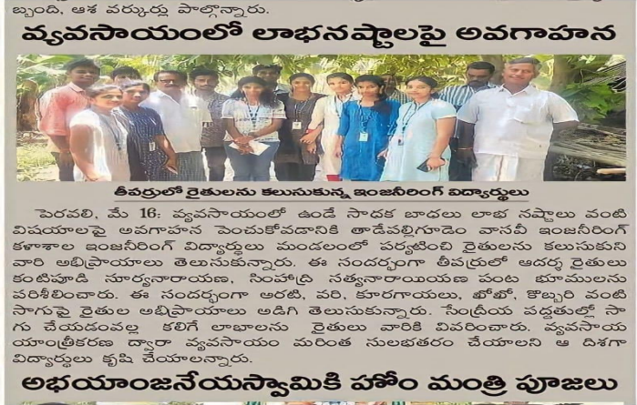
Date: 17/05/2023, Edition: East Godavari District, Page: 10 Source : https://epaper.andhrajyothy.com

లవ హా వెళ వేశ ను వివె శ నా చూ చౌ కూ తా సిద్ధ తొ రెం తా వెణ్ పెళ్ శ