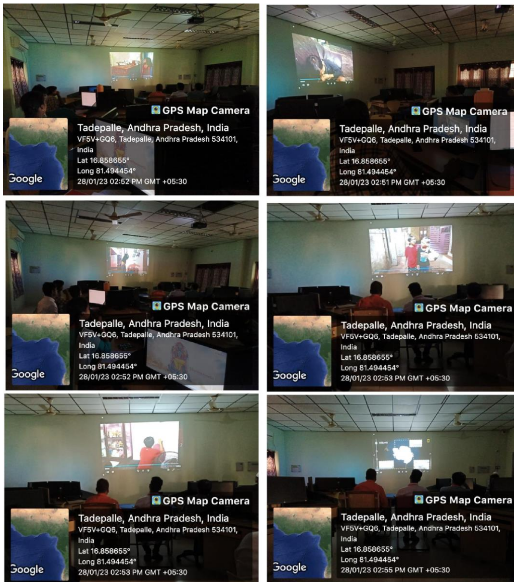
Fig - Participants of Short Videos

This short video competition is to enrich students analytical, design and technical skills. About Awareness on Energy Conservation. This event conducted on 28-01- 2023 on the Eve of Awareness on Energy Conservation Week (23rd Jan 2023 to 28th Jan 2023) organized by Lee Association in EEE Department and a total 40 participants registered in this event.