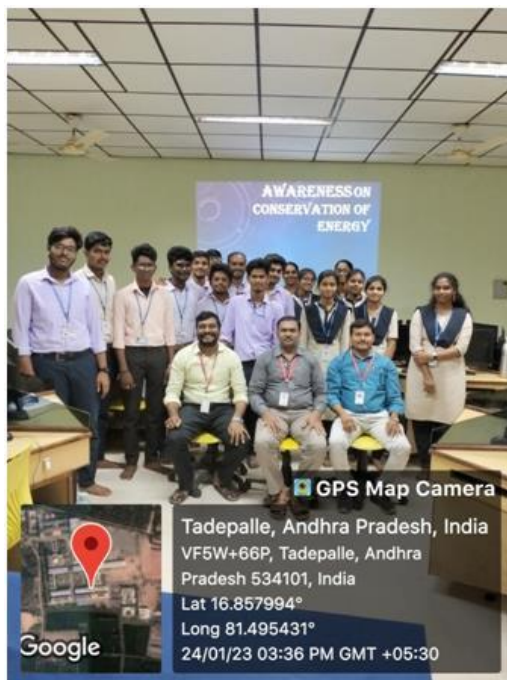
Fig - Participants of Power point Presentation

Power point presentation on Awareness on Energy Conservation is the academic activity conducted on 24.01.2023 on the Eve of Awareness on Energy Conservation Week (23rd Jan 2023 to 28th Jan 2023) organized by Lee Association, EEE Department. Total 30 batches nearly 50 students from the programme like Diploma, B.Tech, MBA participated in this event.