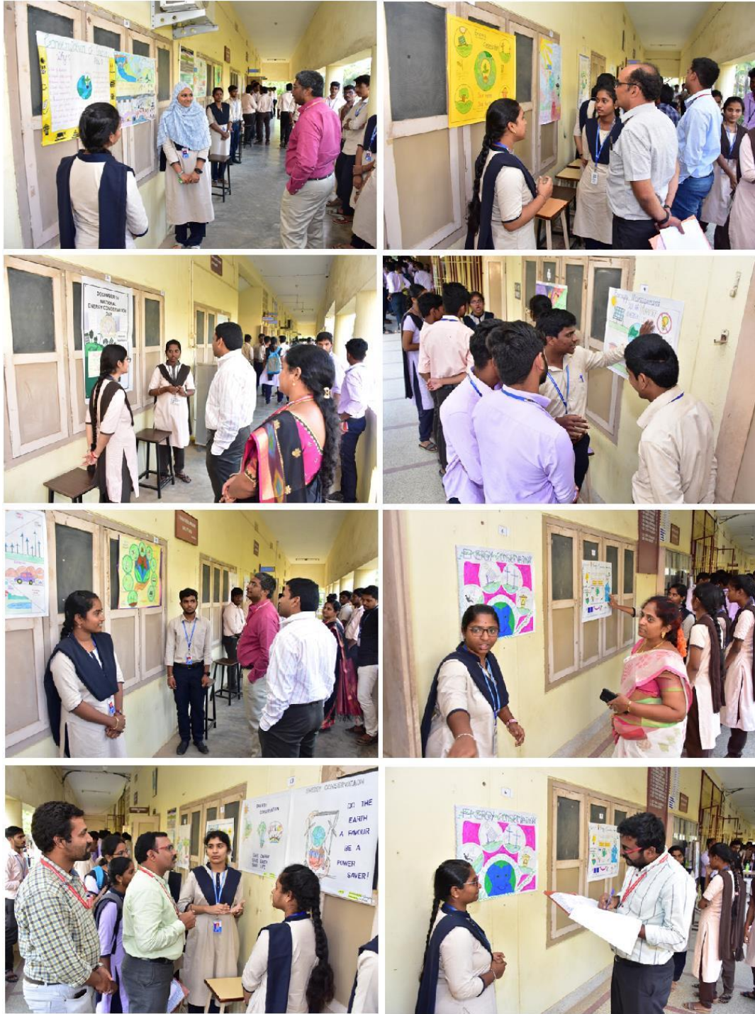
Fig - Participants of Poser Presentation

Pedatadepalli, TADEPALLIGUDEM – 534 101.W.G.Dist. (A.P)