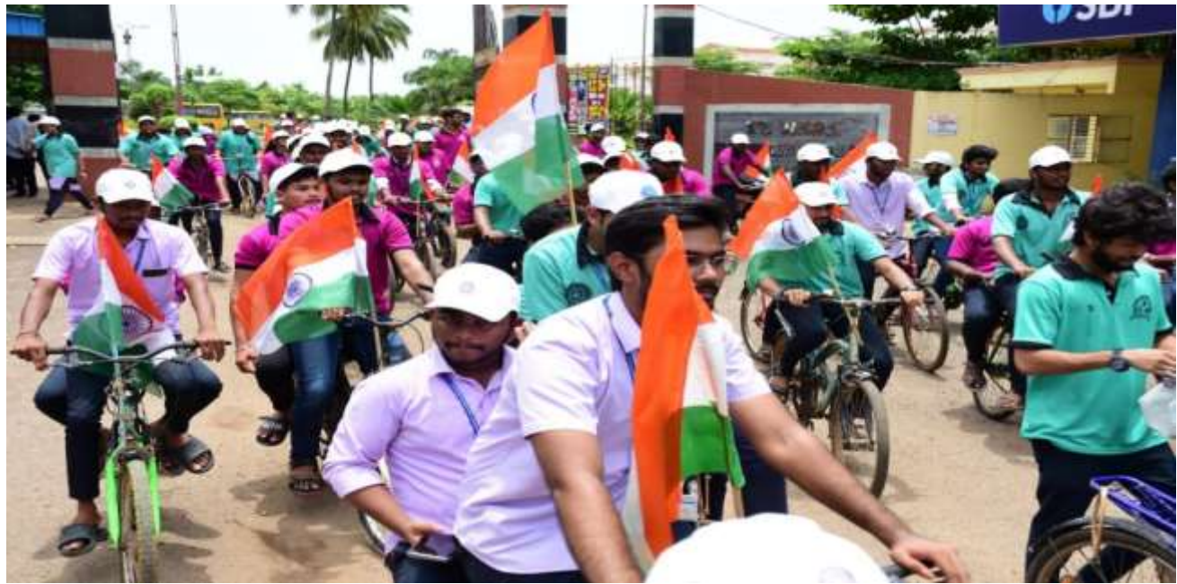
Azadi Ka Amrita Mahotsav(500 feet Indian flag rally)13/08/2022